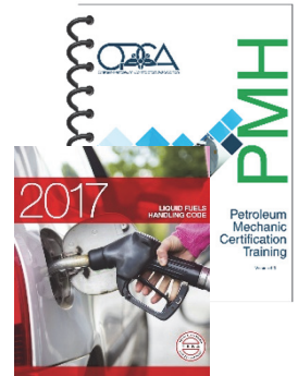
OPCA Manual and Liquid Fuels Handling Codebook

Students must bring their own codebook, OPCA will not supply codebooks. Students are not allowed to share codebooks.